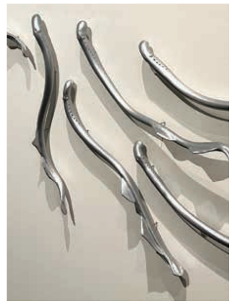
Kanakana Sculptures x 35